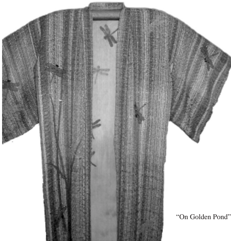
"On Golden Pond" by Regine Carey