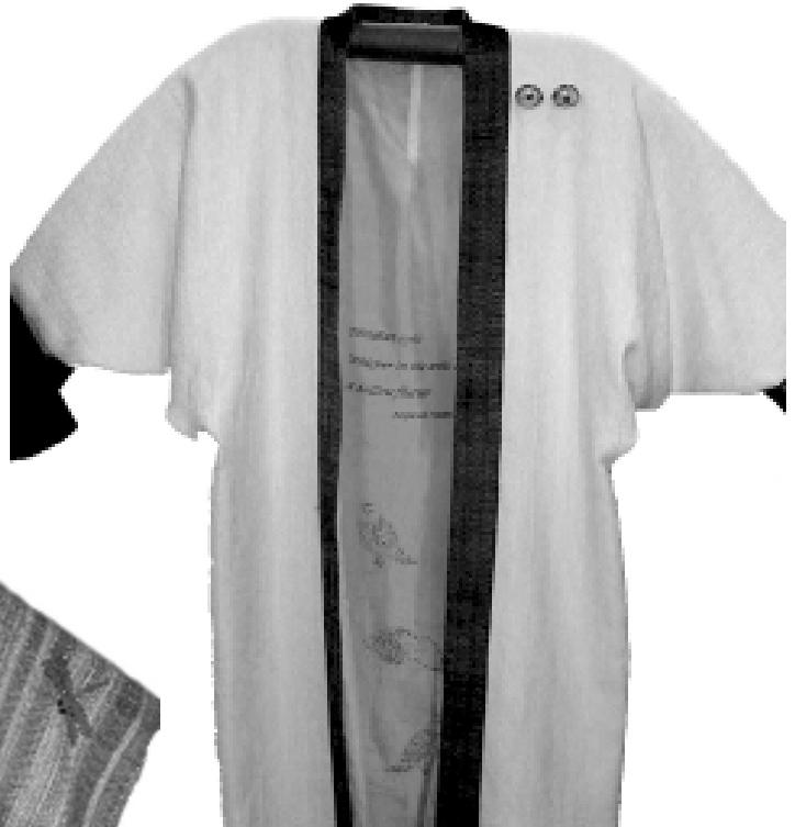
"Kimono of the Snowy Owl" by Erica Plotkin