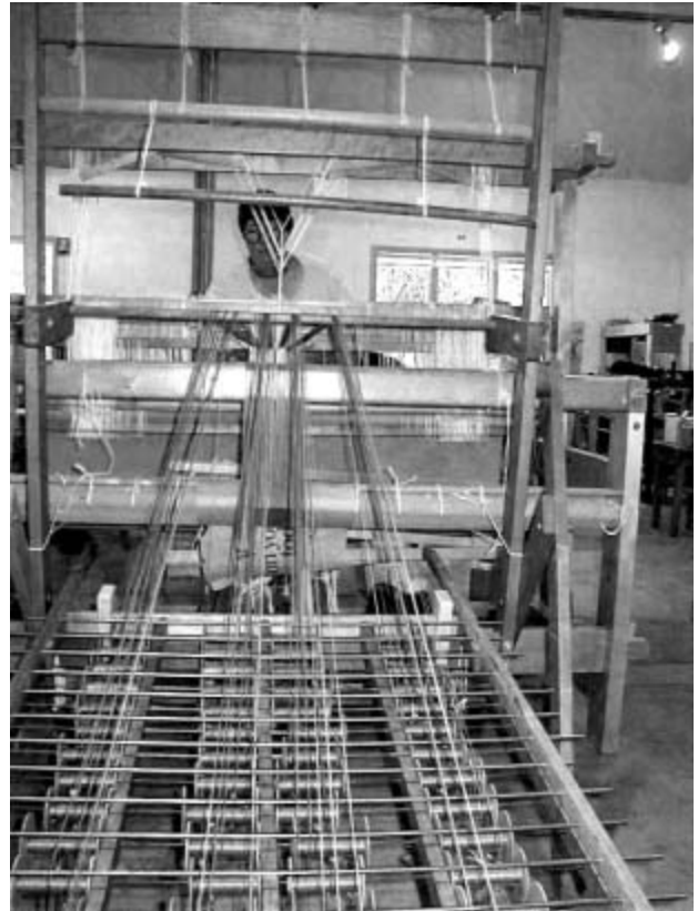
Student weaves velvet at the Eugene Conference.