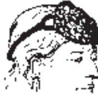
Part of the acorn harvesting outfit of the Hupa Indians, California. From American Indian Basketry , Dover Publications.