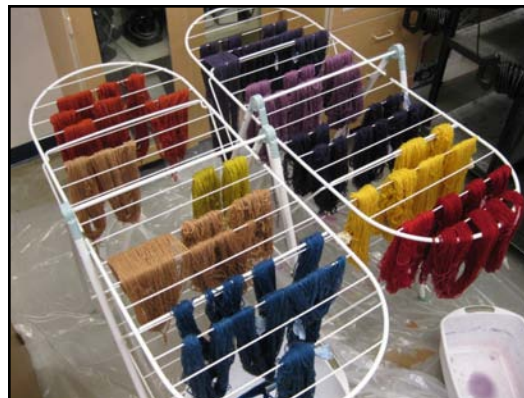
Vibrant colors dry in Linda Hartshorn’s “Natural Colors to Dye For”, a 3 day pre-conference workshop.