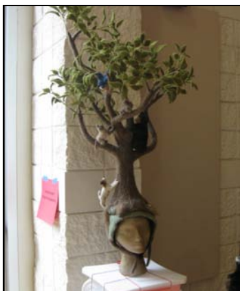
Best of “Beyond the Horizon”