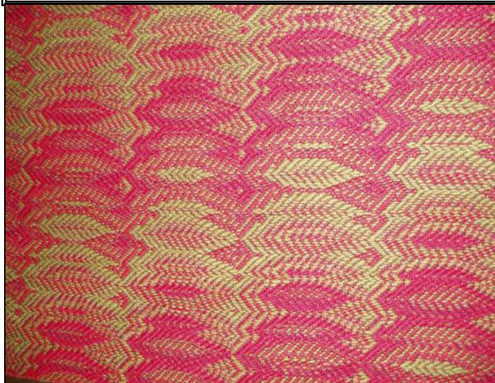
COTTON RUNNER "COLEUS"